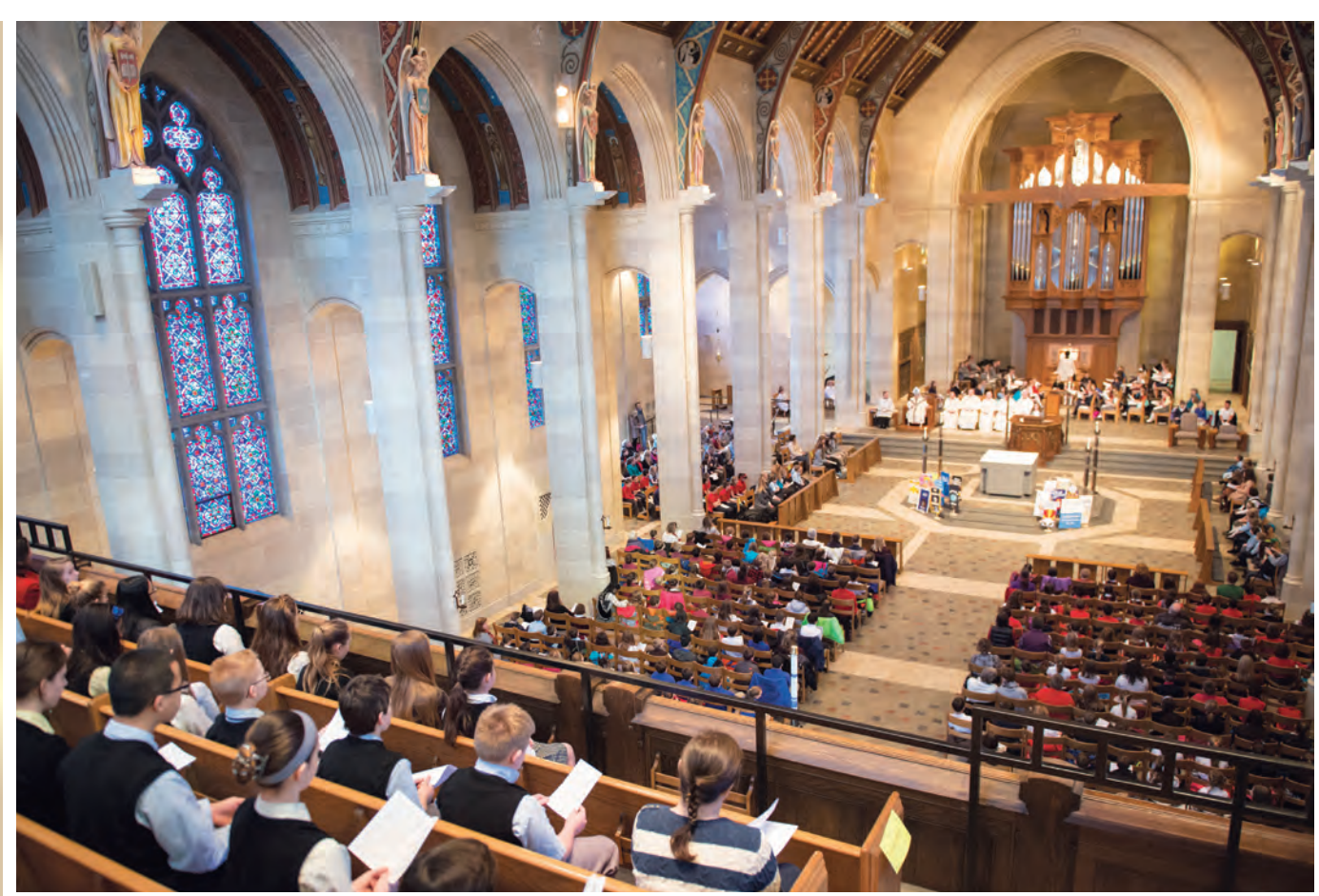
2017 Catholic Schools Week Mass at Sacred Heart Cathedral.