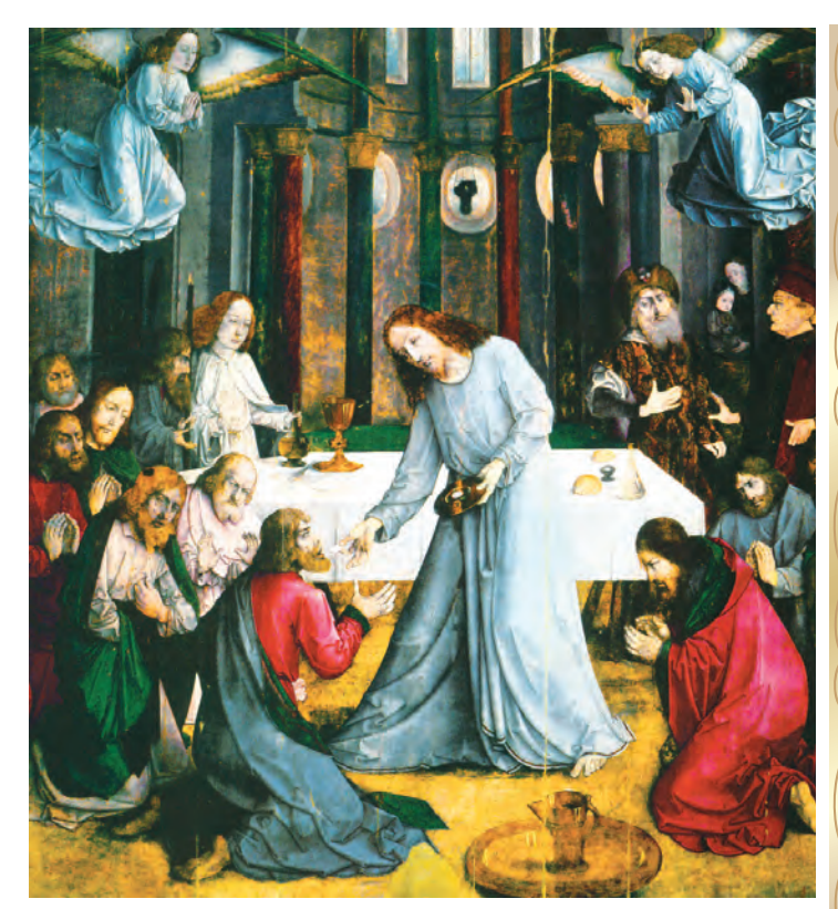
The Communion of the Apostles by Joos van Wassenhove

These themes present a very thoughtful and serious exhortation to all who have the privilege of preparing for liturgical celebrations. In parishes, in cooperation with and under the guidance and direction of the pastor, parochial vicar, and parish administrators, liturgical committees are primarily centers for catechesis and evangelization in which the members work to assure that the sacramental celebrations, culminating in the Holy Sacrifice of the Mass, are celebrated with solemnity, devotion, reverence and a true spirit of unity, which unites the local Church to the Church Universal and teaches the faith of the Church. "Every celebration of the Eucharist is performed in union not only with the proper Bishop, but also with the Pope, with the episcopal order, with all